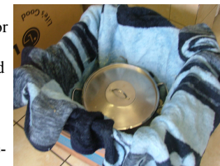
Amazing isn't it ?

The staff at St Francis Centre are just as aware of the need to conserve energy and decrease one's carbon footprint as anyone else in the world is so we are always keen to hear of ideas to assist in this matter . With the soaring cost of electricity our staff have all been thinking 'out of the box' as they say and lo - we thought our way into the box or rather 'boxes'. We are extremely proud to brag about the ' Hay boxes' that are currently being used to cook much of our food. As you can see, strictly speaking they are no longer HAY boxes but are rather insulated with polystyrene and blankets but the idea has been around for a long time. The food is brought up to whatever temperature is needed on the stove and then popped into the box, closed down and left until the food is needed - and there it is, all gently steaming ready for the plates. Some of our staff were very sceptical at first but they are all confirmed believers now. The idea is equally useful anywhere - when we have power cuts - rural areas with no electricity - a need to save money - maybe we all need some encouragement, no matter what drives us it is the right thing to do as well as being healthy for us AND for the planet !